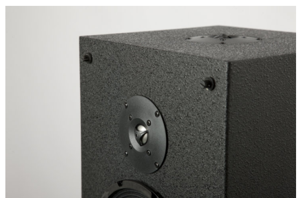
Front and top firing high frequency drivers provide wide dispersion