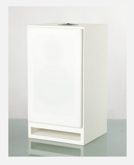
Also available in white finish

Constructed from 18mm birch ply and utilising industry proven quality components, its performance and operation is ensured for many years.