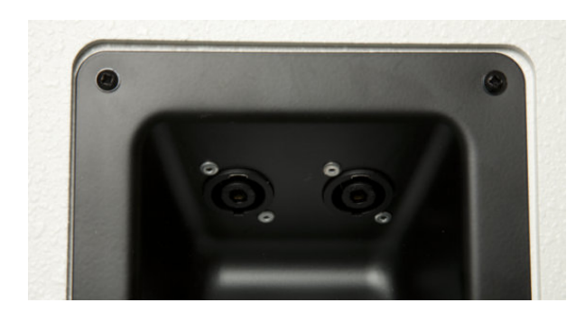
Recessed connection plate enables direct to wall mounting.