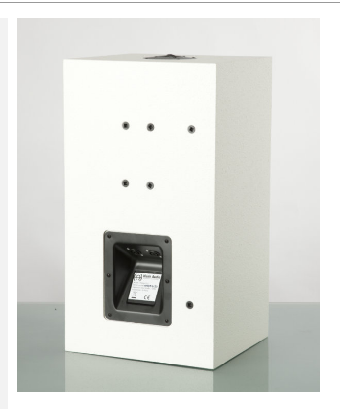
Rear M8 fixing screws allow the fitment of WB8 & FP8 wall brackets

DSP settings for Hush Audio speakers are available on request. For further information about specific system applications, please ask for our system configuration brochure.