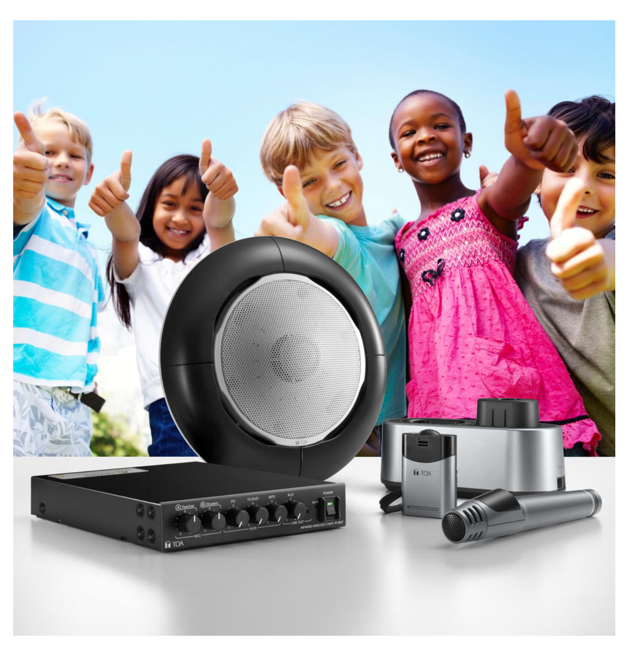
Enrich Your Students' Learning Experience with Remarkably Clear, Easily Audible Classroom Communication.