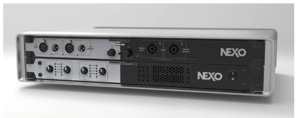
DTD Controller + DTDAMP: input/output patch bay, processing and 5 kW of power in a 2U light rack.

When used with the Nexo DTD controller the DTDAMP is the perfect solution for "Dry" hire or where the user has a limited knowledge but still allowing the best possible result from the Nexo speaker system.