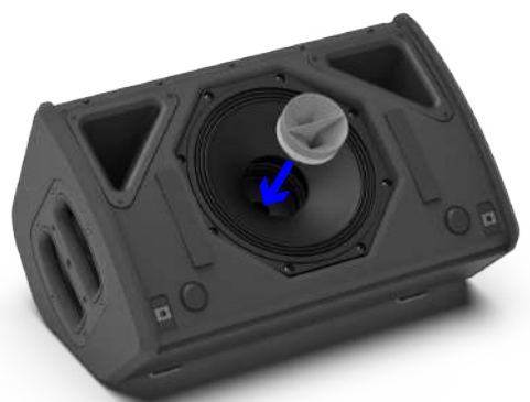
Grille removed, an optional magnetic horn can be quickly fitted to change directivity from 100°x100° to 110°x60°

P8 acoustic phase response is NEXO phase signature allowing inter-operability between all NEXO speakers at all crossover points, except for the monitor setups where latency is minimized.