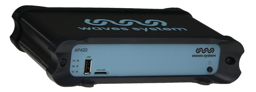
AP420/AP420 Wireless +

The most handy range of audio sources for background music and messages